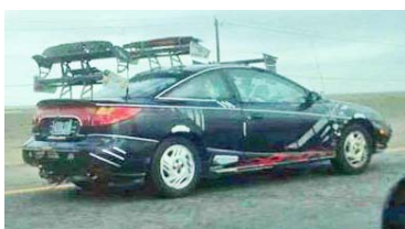
Spoilers, too many

bi.ingalls@gmail.com co.ingalls@gmail.com