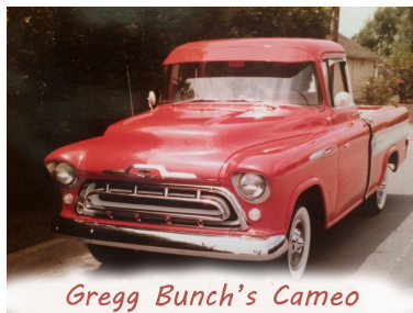
Gregg Bunch's Cameo