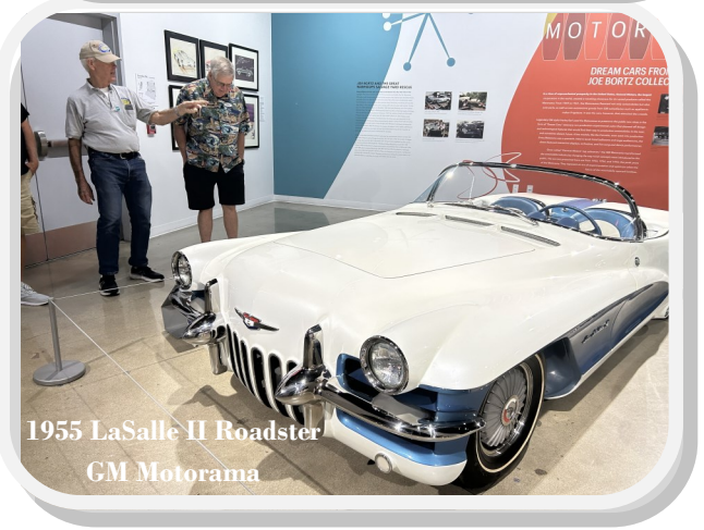
1955 LaSalle II Roadster GM Motorama