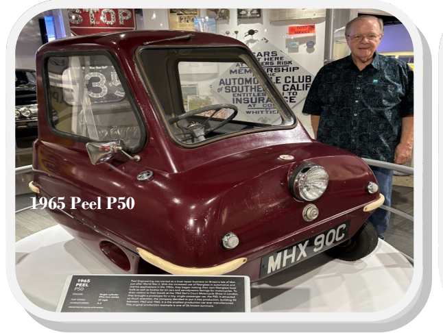
1965 Peel P50