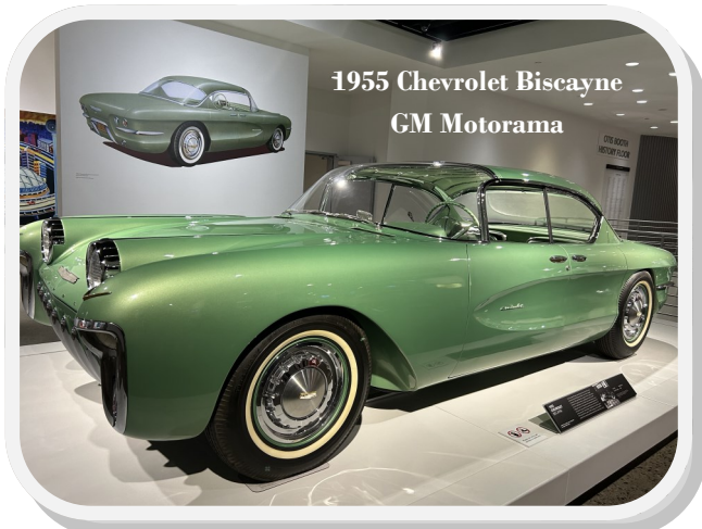
1955 Chevrolet Biscayne GM Motorama